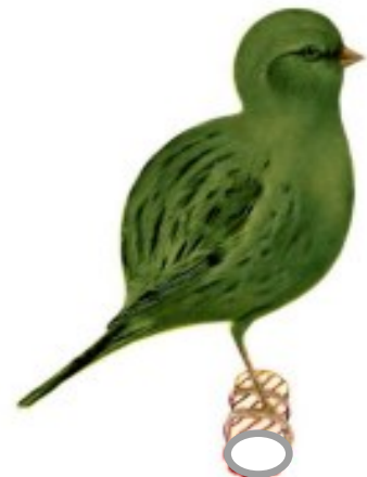
Yellow Green Self