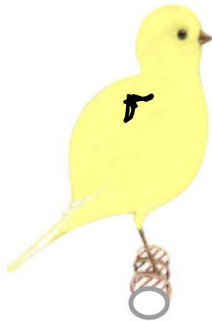
Buff Clear Ticked