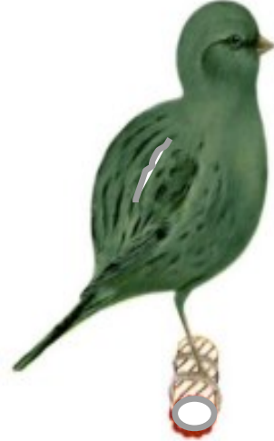
Buff Green Foul