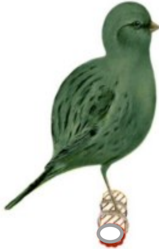
Buff Green Self