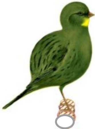
Yellow 3/4 Dark