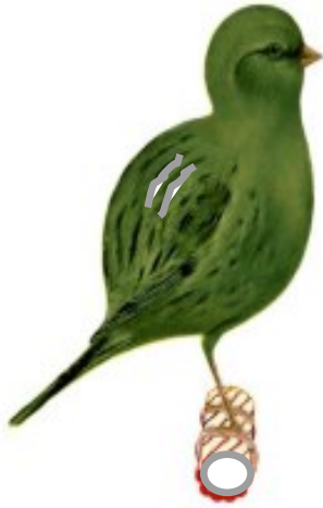
Yellow Green Foul