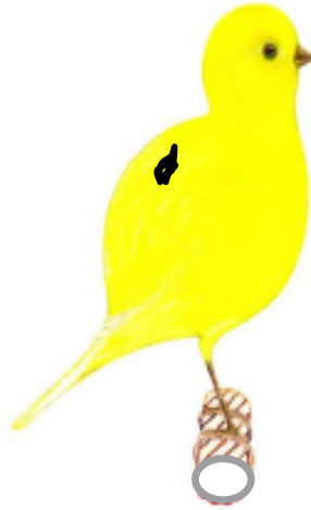
Yellow Clear Ticked